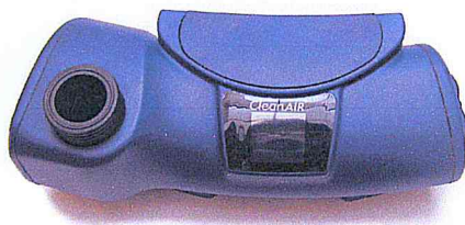
Clean-AIR Chemical 2F Plus TM3