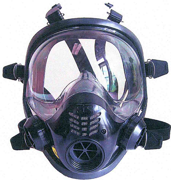
mask Shigematsu GX02