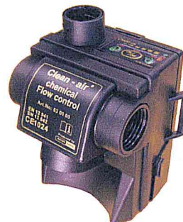
Clean-AIR Chemical Flow Control TM3

Fullfacemask CA-6 (Sundström SR 200) is compatible with turbo unit Clean-AIR Chemical Dual Flow TM3, Clean-AIR Chemical Flow Control TM3, Clean-AIR Chemical 2F Plus TM3 a Clean-AIR Chemical 3F Plus TM3 equipped with filters against particles or gases or combined filters, the set provides protection against harmful aerosols, vapors and gases or aerosols, vapors and gases in accordance with the information supplied by the manufacturer.