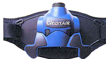
Clean-AIR Chemical 3F Plus TM3