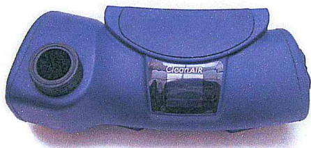
CleanAIR Chemical 2F Plus TH3