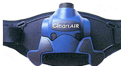
CleanAIR Chemical 3F Plus TH3

Full face mask Shigematsu GX02 in combination with a suitable filter protects the respiratory system, eyes and face the user from harmful substances in the air, depending on the type of filter used and according to the manufacturer's instructions.