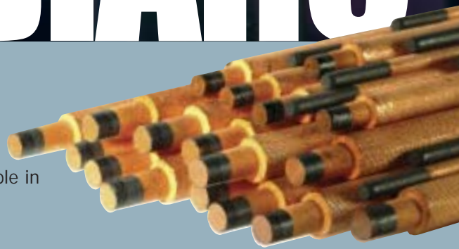
Weight of metal removal per length of electrode consumed

The TEAM BINZEL gouging electrodes are made of artificial graphite and have a pure copper coating. The gouging electrodes are available in a variety of shapes and diameters to meet the various applications.